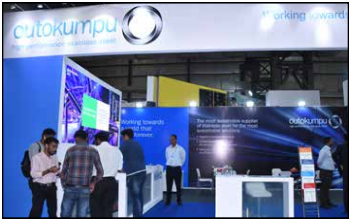
OUTOKUMPU INDIA PRIVATE LIMITED