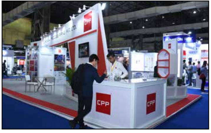
CHEMICAL PROCESS PIPING PRIVATE LIMITED