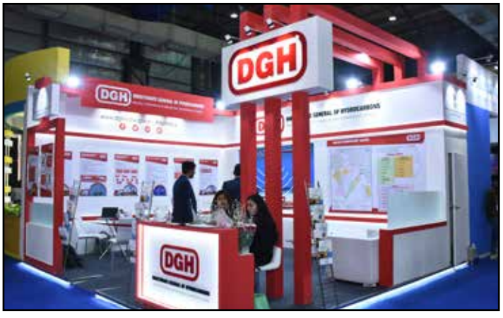
DIRECTORATE GENERAL OF HYDROCARBONS