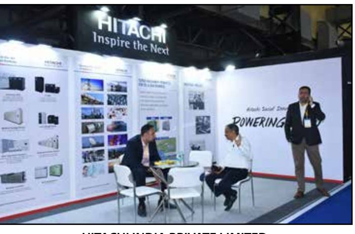
HITACHI INDIA PRIVATE LIMITED