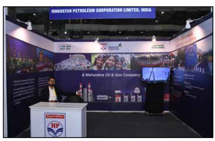
HINDUSTAN PETROLEUM CORPORATION LIMITED